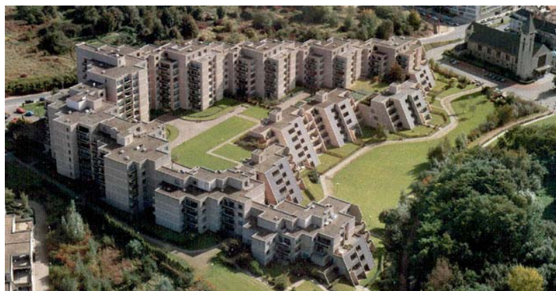
La Sauvenière, Chemin des Deux Maisons 61-85, 1200 Brussels

La Sauvenière is a private housing complex in Brussels with about 350 apartments. The heating and hot water installation, dating from 1980, has been completely refurbished for being inefficient and outdated. A Combined Heat and Power installation has been installed, fuelled by vegetable oil. Moreover a large sun collector is being installed.