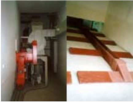
System of wood-chip feeders at MPGK in Jelenia Gora

Timetable of implementing the project is shown below.